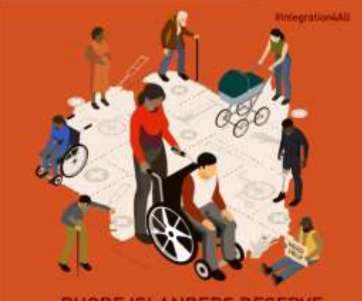
RHODE ISLANDERS DESERVE AN OLMSTEAD PLAN

Register now for FREE: <u>REGISTER HERE [us02web.zoom.us]</u>